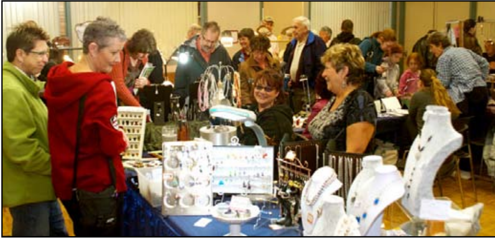
Having a good time.