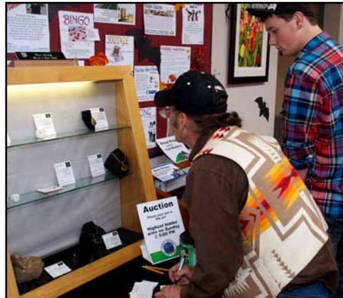
Getting in a good bid in at the Silent Auction.