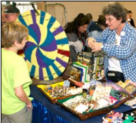
And we have a winner!