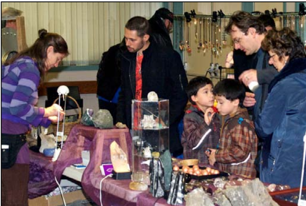
Crystals and minerals and fossils, oh my!