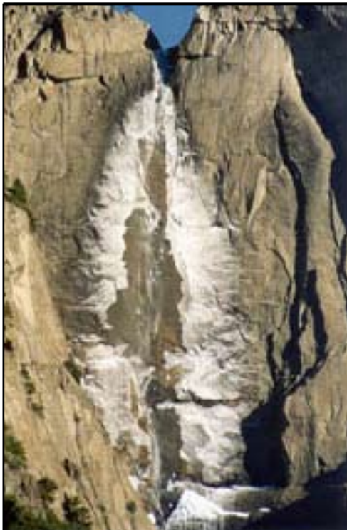
Yosemite Falls with ice mist and sno-cone