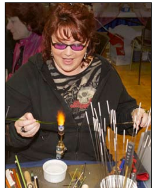
Hot stuff! Glass bead demonstration.