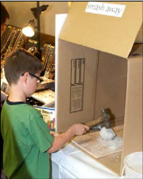
Plenty for the kids to do at the Rock Smash (above) and Kid's Corner (below)