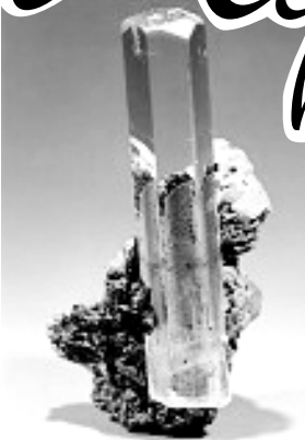
Aquamarine on Calcite from Skardu, Baltistan, Pakistan, (winner, 2nd place, Specimen image contest, Bob's Rock Shop)

Aquamarine is almost as popular as the classics: ruby, sapphire and emerald. In fact it is related to the emerald, both belonging to the beryl family yet is almost entirely free of inclusions. Aquamarine has good hardness (7 to 8 on the Mohs scale) and a wonderful shine. That hardness makes it very tough and protects it to a large extent from scratches. Iron is the substance which gives aquamarine its colour, a colour which ranges from an almost indiscernible pale blue to a strong sea-blue. The more intense the colour, the more value is put on it. Some aquamarines have a light, greenish shimmer; that too is a typical feature. However, it is a pure, clear blue that continues to epitomise the aquamarine, because it brings out so well the immaculate transparency and magnificent shine of this gemstone.